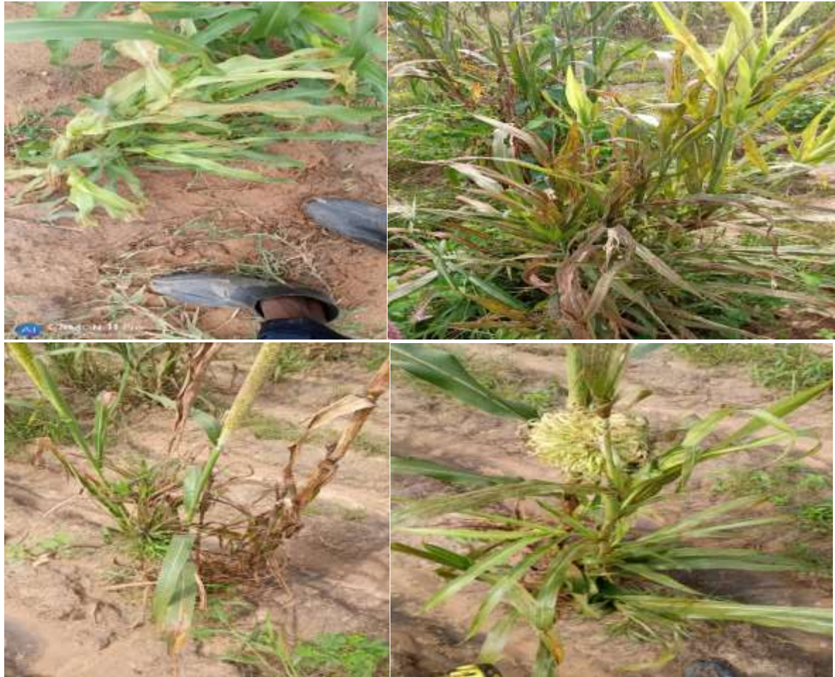
Plate 1: Downy Mildew manifestations