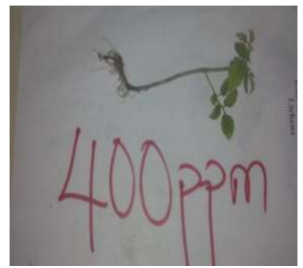
Plate 6: Differences between control and 400ppm tomato (Lycopersicon esculentum) treatments.