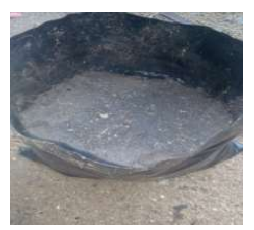
Plate 4: Soil treated with Pb<sup>2+</sup> ion