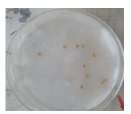
Plate 3: Seeds sown in vitro study