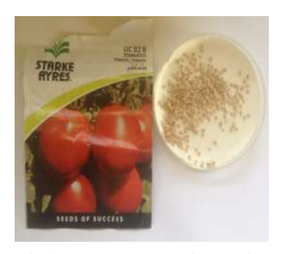
Plate 1: Tomato (Lycopersicon esculentum) seeds