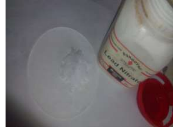
Plate 2: Pb (NO<sub>3</sub>)<sub>2</sub> salt