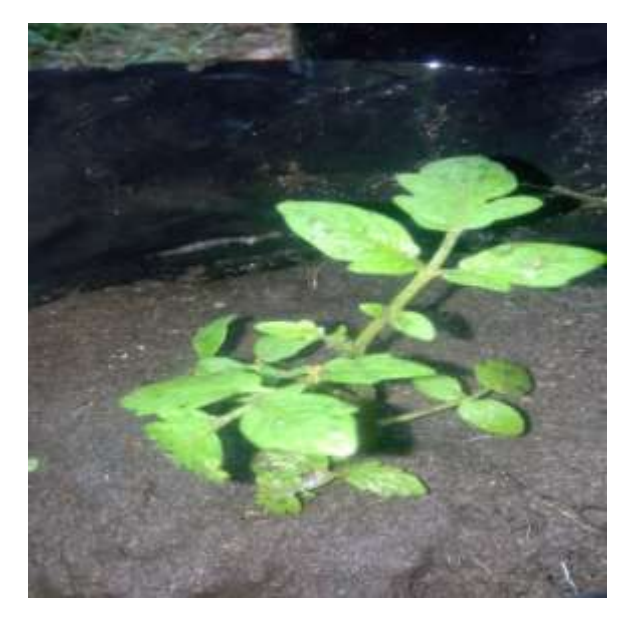
Plate 5: Young tomato (Lycopersicon esculentum) seedling growing in lead treated soil after 4 weeks