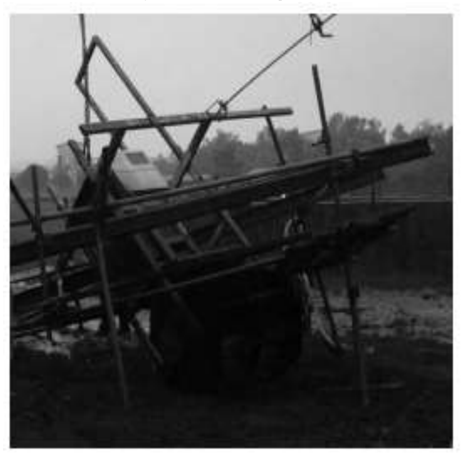
Fig. 5: Hanging waste water power generating system after one year of proof run

Fig. 4: (a) Hanging waste water power generating system before installation; (b) Hanging waste water power generating system after three months of proof run.