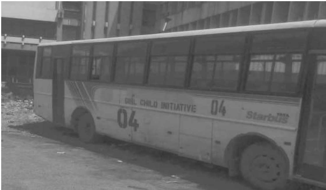
Plate 2: Grounded Bus