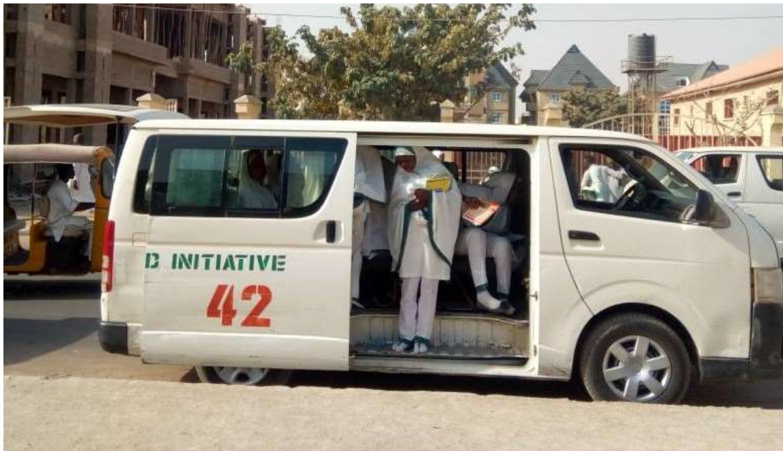
Plate 1: Functional Buses