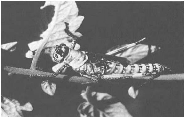
Plate II: A third instar variegated grasshopper, Zonocerus variegatus (L.), adult emerged with no antenna and defective wings (Adopted from NRC, 1992)