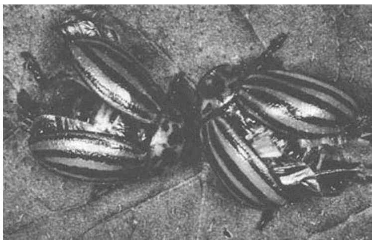
Plate III: A Colorado potato beetle, Leptinotera decemlineata treated with neem oil had malformed wings that can neither function in flight nor be folded flat (Adopted from NRC, 1992)