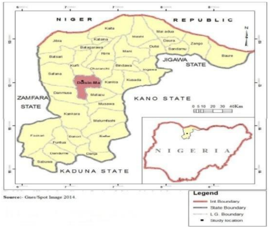
Fig 1: Map of Katsina showing Dutsinma Local Government Area

Retrieved 2009-10-20). The Local Government is bounded by Governments to the South. The major occupation is farming and animal rearing, the inhabitant of the local Government are Hausa and Fulani (NPC, 2006).