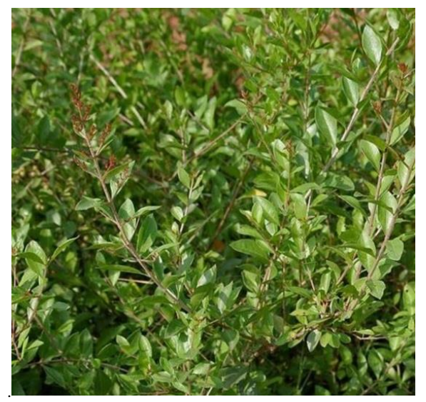
Figure 1: Lawsonia inermis plant

and Northern Australia (Odigie et al., 2022). Lawsone, also known as hennotannic acid, is an aromatic naphthoquinone that gives henna its staining properties. Lawsone is the source of the reddish-brown dye used as a cosmetic agent and is present in considerable amounts in the dried leaves (Barde et al., 2021). Hands, nails, fingers, and even hair can be dyed using henna plants, which are a natural colour. It is applied to the hands and feet as a fertility symbol in Indian traditional medicine (Fareha, 2016). Additionally, it is used in the textile industry to dye wool and nylon and has long been used to cure many diseases (Alawa et al., 2015). Natural dyes such as Lawsonia inermis are vital because synthetic dyes are expensive and pose environmental risks. Applying a natural dye, such as Lawsonia inermis to stain different biological tissues will be cheap and have a smaller impact on people and the environment (James et al., 2017). The study aims to explore the use of Lawsonia inermis aqueous extract (local stain) as a substitute for methylene blue in buccal cell staining.