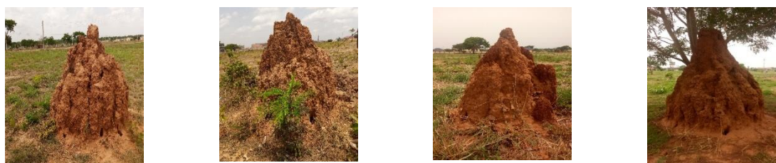
Figure 2: Termite mounds

The mounds have tapering ends, thus, they are broader at the base and narrower towards the top as shown in Figure 2. The narrower end towards the atmosphere is to reduce surface that is heated by the direct overhead Sun, and to reduce surface cover that is affected by vertical rainfall. The surface covers are rough, all the mounds have vents at the base, some have recent evidence of construction by the termites, and the mounds are fairly straight with a dome shape (Figure 2) not as the adjacent pediment that is relatively flat.