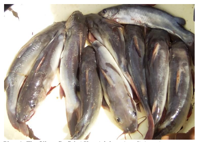
Plate 1: The Silver Catfish (Chrysichthys nigrodigitatus)

fish landing sites in Okerenkoko fishing community between September 2023 to February 2024.