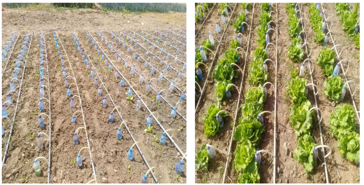
Plate 1: The Set up (a) immediately after transplanting (b) at maturity.