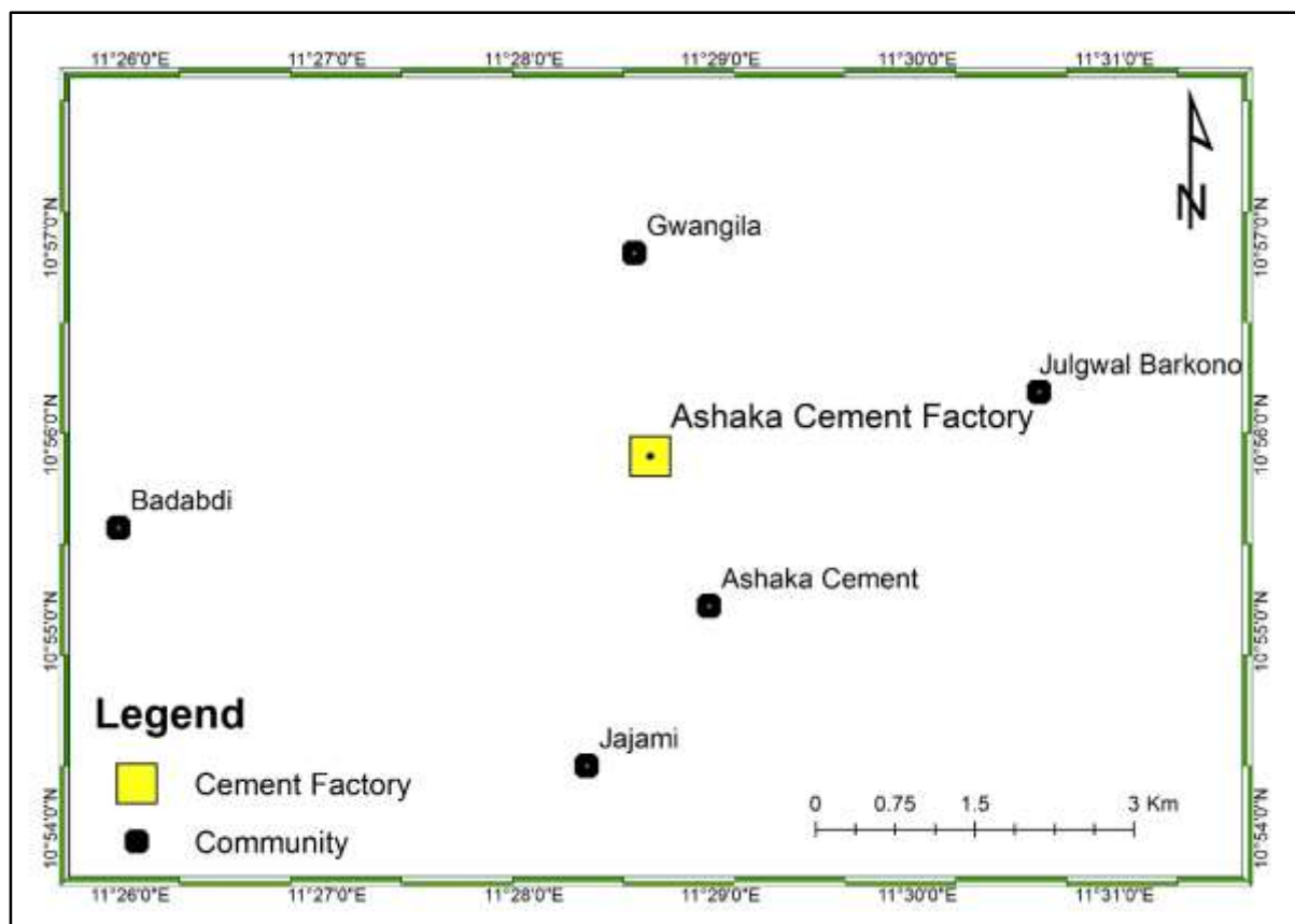
Fig. 2: Map showing the study area.

company. The study area comprises of five communities, this include Ashaka Cement, Gwangila, Badabdi, Julgwai Barkono and Jajami. Its geographical location lies between latitudes 10.919 –10.929 N and Longitudes 11.465 – 11.477 E. The study area falls within the Gongola Basin, North-eastern Nigeria. The regional geology of the study area comprises of the basement complex and the Cretaceous to Tertiary sediments (Usman et al. , 2018). These sediments are characterised with substantial deposits of sandstone and limestone (Mayomi et al. , 2018). Figure 2 is a Map of the study area.