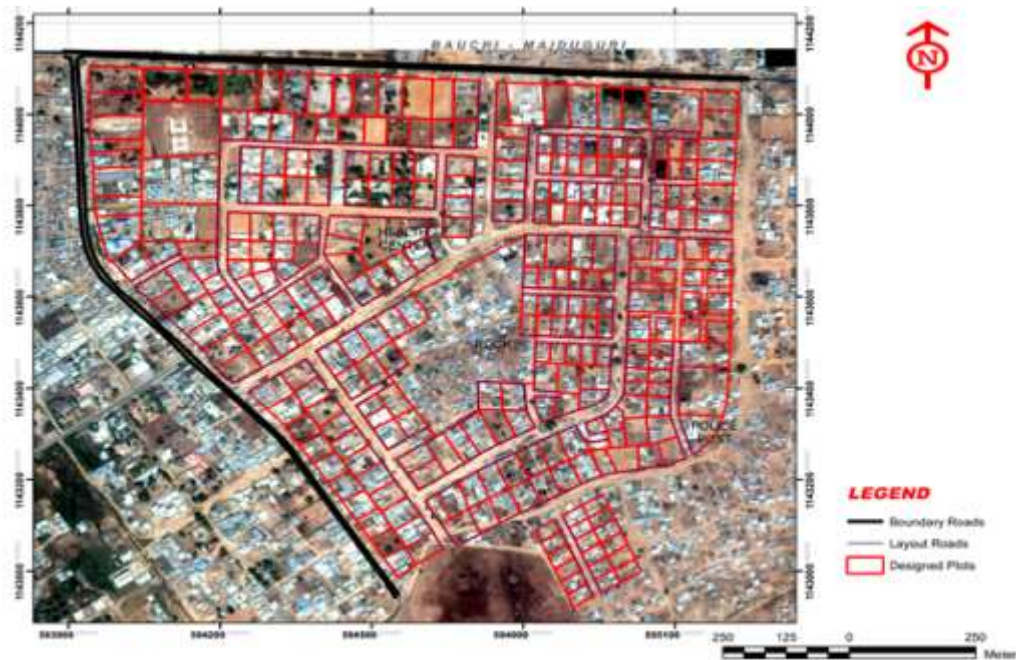
Fig. 2: Fadaman Mada West (DP 23) Residential Layout – Image Overlay

The overlay of the layout plan (as designed) and the corresponding satellite image of the area it covers on the ground are presented in Figure 2.