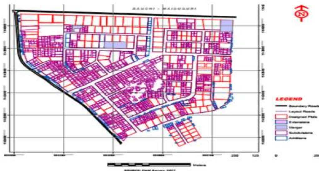
Fig. 3: Fadaman Mada West (DP 23) Residential Layout as built

From a comparison of the layout plan as designed (Figure 2), and as built (Figure 3), four types of geometric changes are discernible: subdivision, extension, merger, and addition. In subdivision, the designed plots are further parcelled into smaller sizes. The incidence of subdivision in the layout is summarised in Table 2.