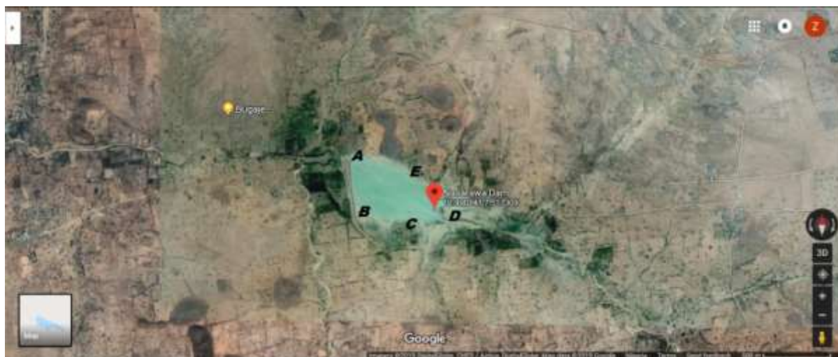
Fig. 1: Study Area Showing the Sampling Sites