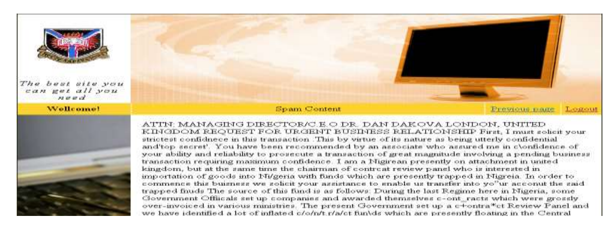
Fig. 3: Sample of the Spam Content received

Figure 2 is the list of classified spam mails received at the recipient inbox having scan with the Algorithm