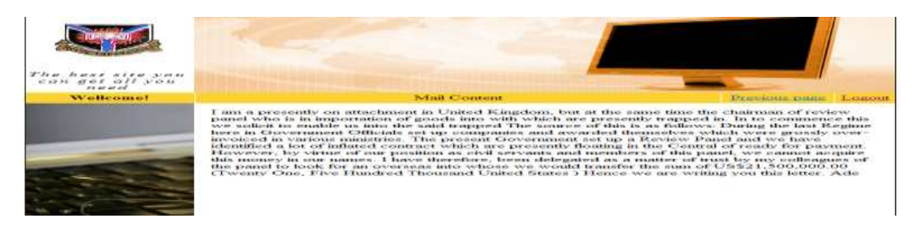
Fig. 5: Sample of the Ham Content

Table 1 show result of the algorithm tested with known spam mails, those subject names ends with later "a" are spam mails with spam's suspicious content not manipulated and those with the subject names end with later "b" are the spam mails injected with manipulated suspicious words/tokens, before tested with the algorithm. But were all classified as spam