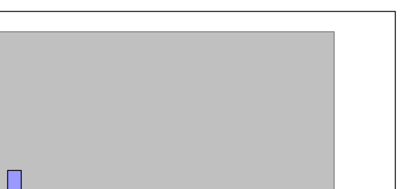
Fig. 2: Elemental Composition of Jos Ray-Field cassiterite