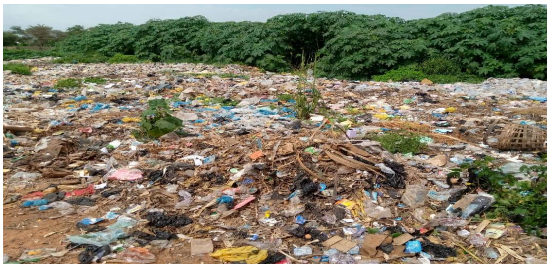
Figure 4: The Open Greywater and Solid waste disposal area in Damaturu.

Thus, policy statement about Greywater reuse and disposal needs to be implemented by the government in order to reduce the menace and proliferation of diseases from within and outside the community.