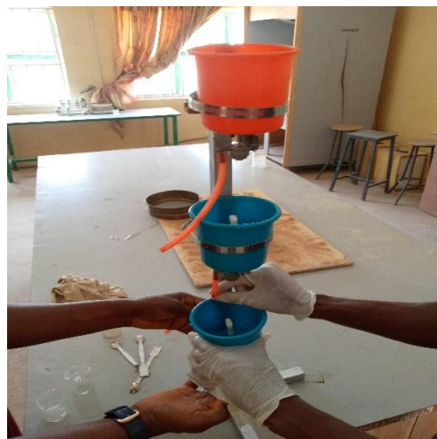
Figure 3: Setting up the Greywater reclamation system.

Laboratory items/materials used in this study includes;