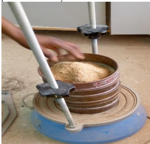
Figure 2: Sieving the rice husk.

the relative abundance of the material as an agricultural by-product from the study area.